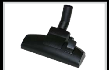
Wessel-Werk Combo Floor Tool for Carpets & Hard Floors