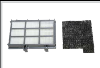
HEPA Exhaust Filter & Pre-Motor Filter