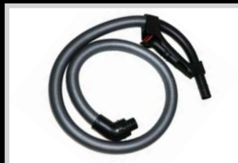
1.8 Metre Long Vacuum Hose