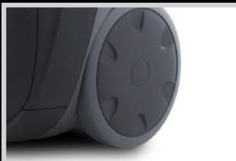
Soft Rubber Wheels