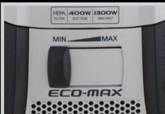
Variable Suction Control

This machine uses 35mm tools and attachments