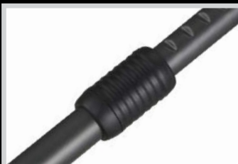
Lightweight & Adjustable Steel Telescopic Rod