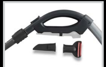
Ergonomic Handle with Accessory Holder

CONTACT CLEANSTAR FOR YOUR NEAREST STOCKIST